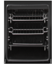
26cm x 43cm x 35cm (39lt)