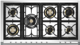
6 BRASS gas burners (2 woks), 1 mega wok